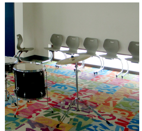
Design continuity is achieved by featuring Intellect Wave cantilever chairs in music classrooms and throughout the school.