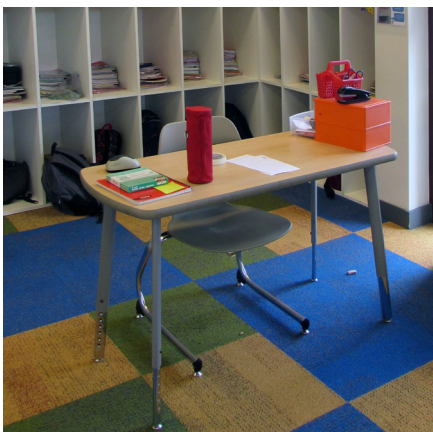
Teachers work from 18" Intellect Wave cantilever chairs and height-adjustable Intellect® Activity tables, which are compact and easy to move.

Solution: Height-adjustable Intellect Wave® trapezoid desks and cantilever chairs deliver worksurfaces at the perfect height with 15" - high seats that are ideal for this age group. Trapezoid-shaped desks smoothly configure into the preferred groups of six. Cantilever chairs don't restrict leg movement and promote sitting position changes. This enhances student attention and engagement, which ultimately drives more effective learning.