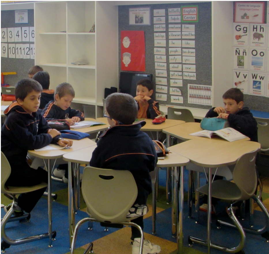
Elementary students learn and work together in clusters that promote communication and sharing.

Challenge: Colegio Huinganal is an elementary school that focuses on personalized and comprehensive education.